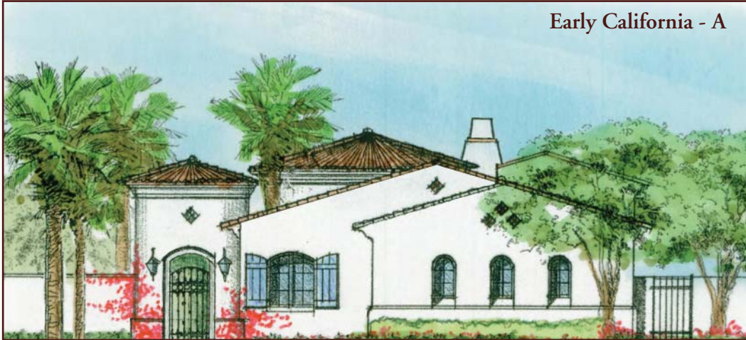
Early California - A