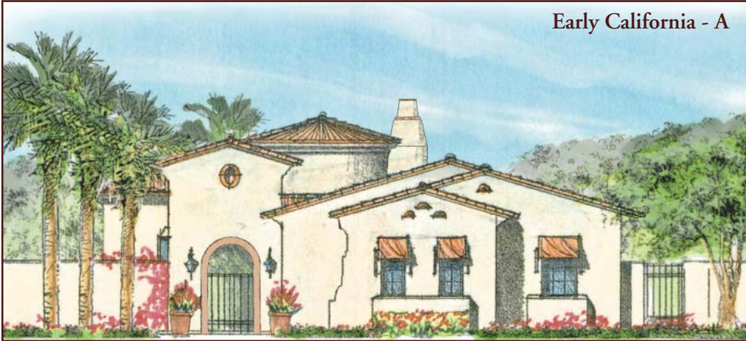
Early California - A