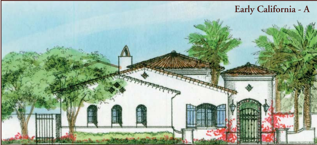
Early California - A